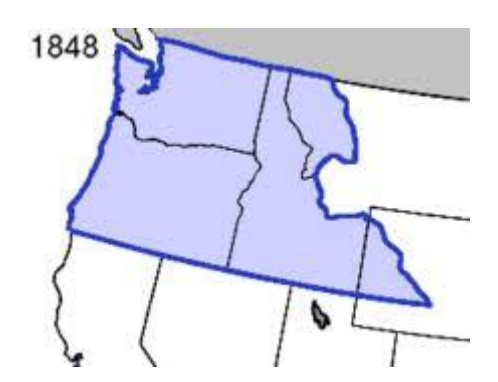
In 1848 Congress created Oregon Territory.

In 1848 Congress created Oregon Territory comprised of the future states of Oregon, Washington, Idaho, and two small parts of western Montana and Wyoming. (See map.)