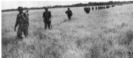
Carlson's Raiders crossing a kunai grass field on the Long Patrol.

In a fire fight, the Japanese soldier, whose personal weapon was a bolt-action rifle, was at a distinct disadvantage against Carson's Raiders. One of Carson's tactical innovations was to expand the traditional nine-man rifle squad to ten men: a squad leader and three three-man fire teams, each team armed with a Garand M-1 semi-automatic rifle, a BAR (Browning Automatic Rifle), and a fully automatic Thompson sub-machine gun. One team of three men was capable of firing 275 bullets in fifteen seconds.