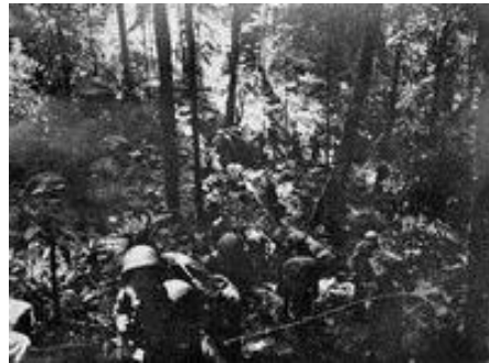
During the Long Patrol, the jungle was also the Raiders' enemy.