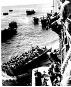
Descending USS Clymer to the landing craft at Bougainville.

At the end of October 1943, the battalion sailed from Espiritu Santo harbor to Guadalcanal and on to Bougainville. On Sunday, October 31, the shipboard activities of the troops had changed. There were hardly any pinochle or small-stake poker games and there was a great deal more cleaning of weapons; even the bullets were cleaned and oiled.