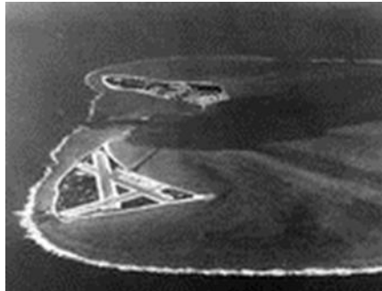
Midway Atoll. C Co. on upper island.

were coming back." Neither did high command, which required that Carlson and Roosevelt remain in Hawaii.