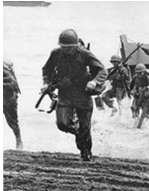
Marines storming the beach at Bougainville.

At the end of October 1943, the battalion sailed from Espiritu Santo harbor to Guadalcanal and on to Bougainville. On Sunday, October 31, the shipboard activities of the troops had changed. There were hardly any pinochle or small-stake poker games and there was a great deal more cleaning of weapons; even the bullets were cleaned and oiled.