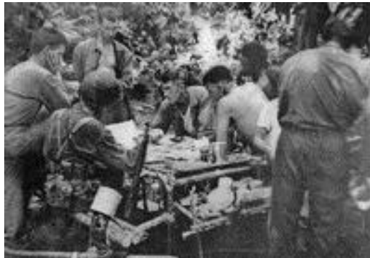
Col. Evans Carlson (center) planning strategy in the jungle during Long Patrol.