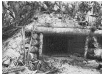
Japanese machine gun bunker on Bougainville.

Since F and G companies had landed 300 yards north of their designated landing site, they head out single file down the beach and turn inland to find and hold their next objective, a clearing with a trail running through it. "We can hear concentrated firing from the direction of the trail," wrote Azine. "F and G are there already. A runner from one of the leading companies comes back. He reports that F and G have reached the opening of the trail, advanced inward a short distance, and are now in contact with the Japs. They are being held up by stubborn mortar and machine gun resistance....This particular skirmish along the trail leading from Empress Augusta Bay into the Bougainville jungle lasts about three hours. When it is over the Raiders have driven the Japs back into the hinterland and secured our section of the beachhead."