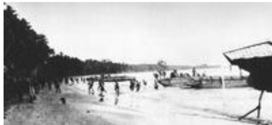
Landing at Aola Bay, Guadalcanal Island, Nov. 4, 1942.

In early November 1942, C and E companies of Carlson's 2 nd Raider Battalion finally got their chance to enter the Guadalcanal fight, if only for a planned two-day mission to provide protection for Army engineers, while the engineers assessed an area of the island as a possible site for another airfield.