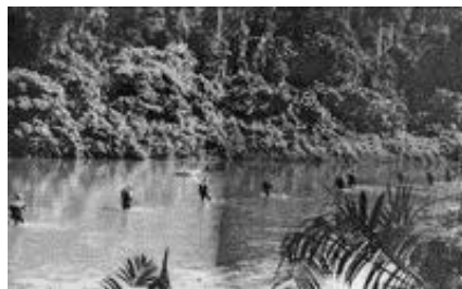
One of many river crossings on the Long Patrol.

"What a luxury after a month on the trail with a pack and a weapon as constant companions, day and night, every minute of a 24 hour day. The lean, gaunt, hollow-eyed Raiders had trekked over 120 miles through steaming hot jungles, burning sudans of open kunai grass, crossing dozens of rivers, streams and swamps intermingled with a series of battles with the enemy Japanese east of the (Henderson Field) perimeter. Daily tropical downpours were alternated with long periods of burning hot sun and no water. Short rations of tea and rice were supplemented with such foods as the natives could scrounge in the bush: papayas, limes, plantains or bananas, etc. Jungle diseases—fevers, fungus, dysentery, sores that refused to heal—literally decimated the ranks of the brave, determined Raiders who strove to fight one more day regardless of the pain and misery, rather than leave their buddies to go on without them."